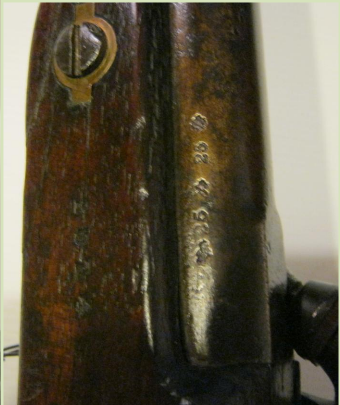
D- Hay Pat. 58

A significant amount of metal appears to have been removed around the breach of C. (see image above and below)