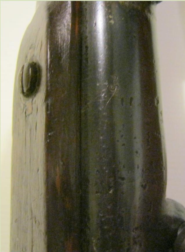
C-Hay Pat. 58 ?