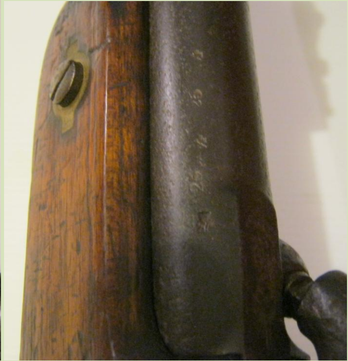
B Pat. 53 or Hay ?