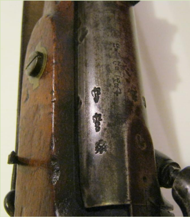
A Pat. 53